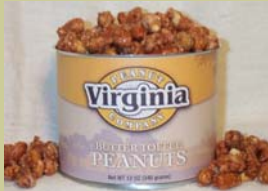
Butter Toffee Peanuts